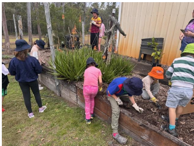
Gardening Club – we planted passionfruit and a blueberry bush