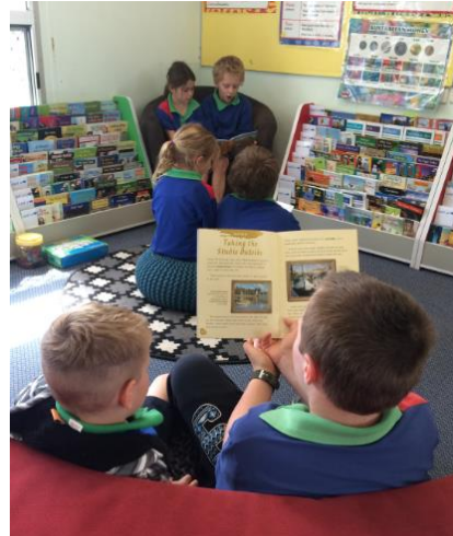
Our Reading Companions