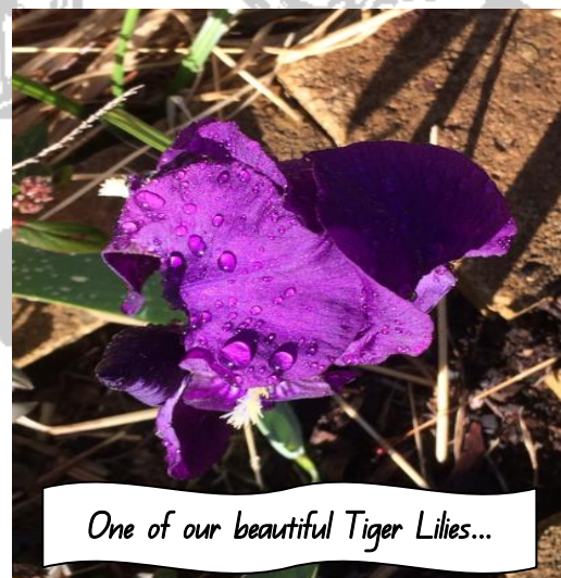
One of our beautiful Tiger Lilies...